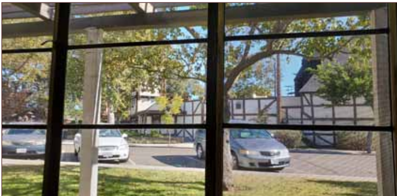
View of Solvang Festival Theater from office window

This is a great opportunity for an owner/user, an investor, or combination of the two.