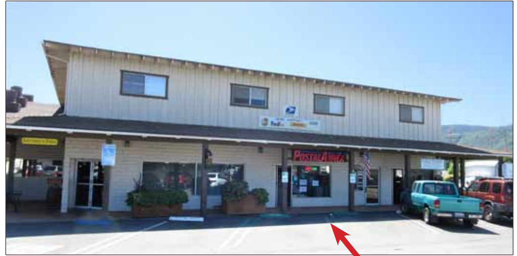
Entrance to Suite 109