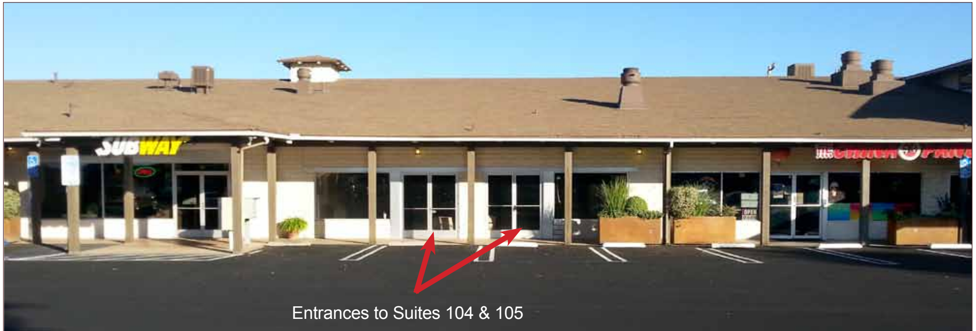
Entrances to Suites 104 & 105

The information contained in this flyer has been obtained from sources believed reliable. While we do not doubt its accuracy, we do not guarantee it.