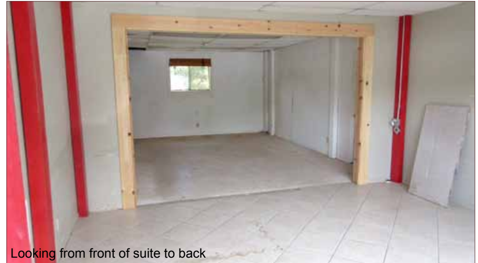
Looking from front of suite to back