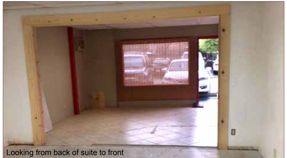
Looking from back of suite to front

The information contained in this flyer has been obtained from sources believed reliable. While we do not doubt its accuracy, we do not guarantee it.